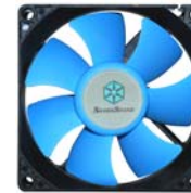
SST-SUSCOOL81 Equip your PS09 with Suscool 81 for the ultimate combination of quietness and performance.