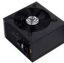
ST40F-ES Affordable quality 400W PSU