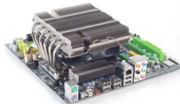
NT06-PRO Equip your PS09 with NT06-E for the ultimate combination of quietness and performance.