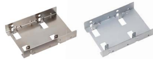
SDP08 / SDP08-LITE Use SDP08/SDP08-LITE to convert an available 3.5" drive bay into two 2.5" drive bays