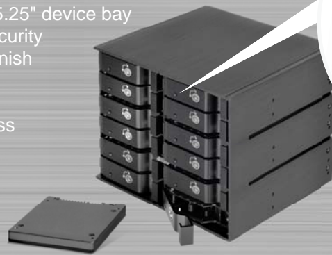
Independent drive status LED