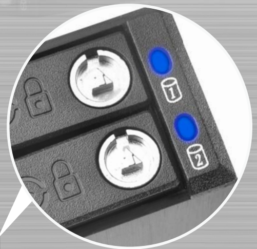
Independent drive status LED