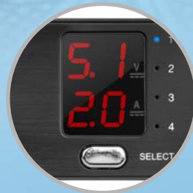
Integrated display for monitoring voltage and current