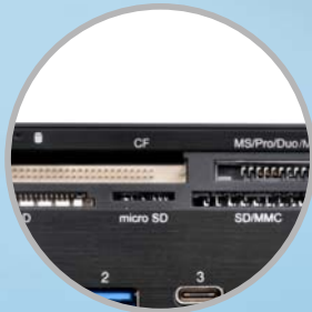
5-slot all-in-one card reader supports CF / SD / XD / MS / TF / M2 cards