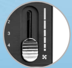
Adjustable fan speed controller for 3pin fan