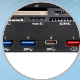
Three USB 3.1 Gen 1 HUB (Type-A x 2, Type-C x 1) and one fast charging port up to 5V/2A