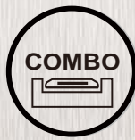
2 in 1