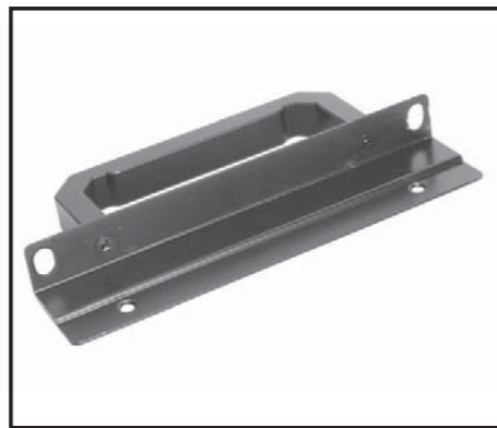
M4 screw x 4, one left support handle and one right support handle