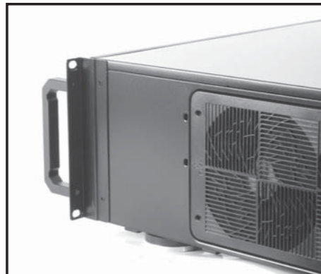
Screw the handles onto the desktop