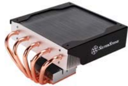
NT06-E High performance CPU cooler