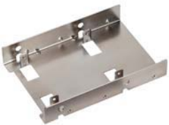
SDP08 3.5" to two 2.5" drive bay adapter