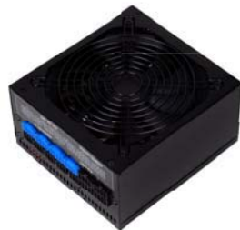
ST1000-P PSU designed for 80 PLUS Silver level of efficiency to reduce wasted heat and save electricity