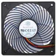
AP121 Revolutionary air channeling case fan