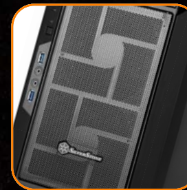
Convenient externally removable fan filters