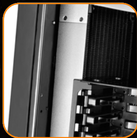
Innovative drive cage design enables support for front and rear AIO liquid coolers