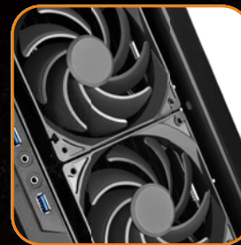
Includes two quiet 120mm fans