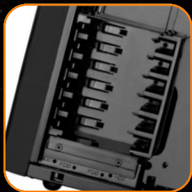
Up to eight 2.5" drives and one 3.5" drive capacity