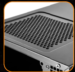
Independent power supply intake vents