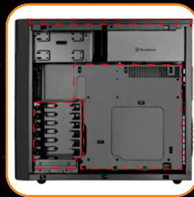
Modular design with removable drive cage, motherboard tray, and top panel