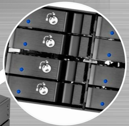
Independent drive status LED